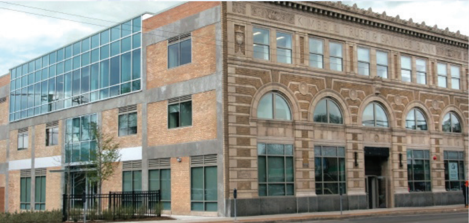
Angel Harvey Family Health Center